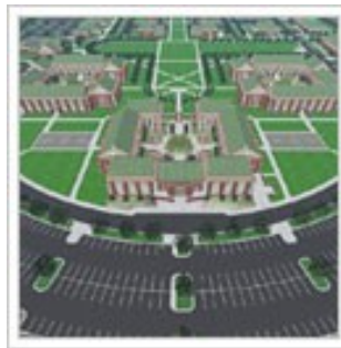
Designed with InRoads

PowerGEOPAK is a powerful product which provides tools to gather, analyze and design 3D data while using MicroStation tools for detail drawings, printing, modeling, visualization, and rendering. It is focused for site design, as the normal GEOPAK is, but it is so much more in its entirety. It also includes tools for Roadway Design, Mapping, Earthwork, Remediation and more.