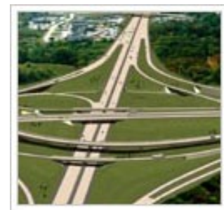
Designed with InRoads

One license of either the PowerInRoads suite or the PowerGEOPAK suite gets you all these features at a fraction of the cost that it would be to buy all of these design tools separately. Also because it is all in one pack, you get the ease of only having to do one install, with one license. That means you do not have to spend as much time setting up the software, but can instead spend that time designing.